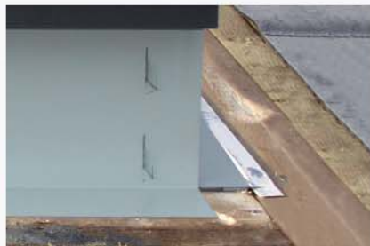
Plug-in plinth before gluing-in