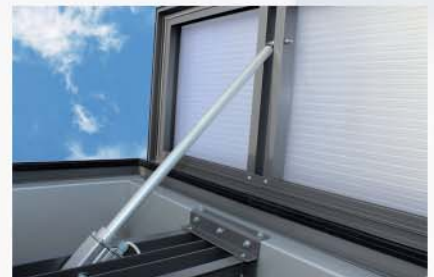
Traverse mounted directly on a plinth