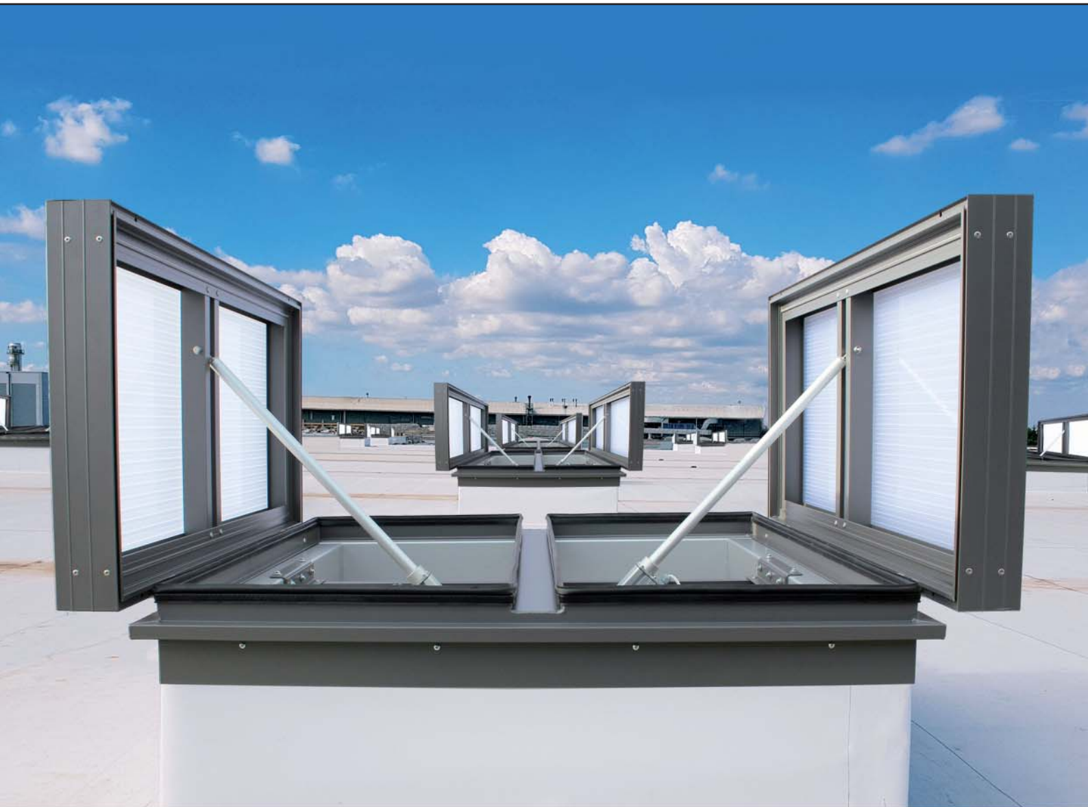
Large picture: The natural smoke and heat extractor VenturiSmoke VS2 in daily ventilation modus