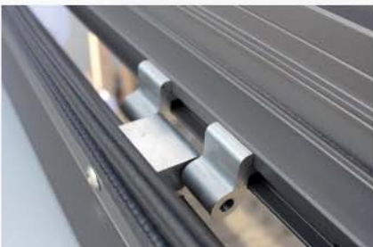
Hinges designed for daily ventilation